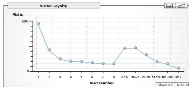
FIGURE 3 STUDENT LOYALTY

Figure 1-3 show vocational initial teachers’ activities in Basic Teaching Skills module. Fig. 3 tracks the number of visits by visitor frequency. The number of visits by students who never returned (no loyalty) are symbolized on the left of the histogram. The number of visits by visitors who returned over 200 times (very loyal) is indicated on the far right.